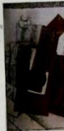
Head of a woman by Braque

It wasn't the hardest. This part of the process took a little bit longer than a week. But in terms of time, it was the longest.