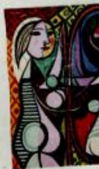
Les Femmes d'Alger by Picasso